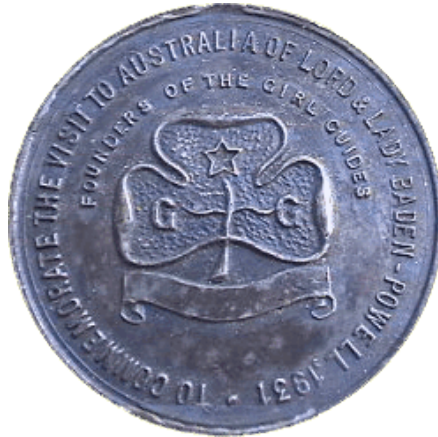
Medal from 1931 visit to Australia