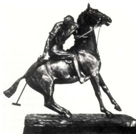
Bronze Polo player