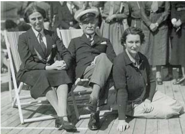
'Orduña' Cruise, 1938

Lord & Lady BP were accompanied only by their daughter Heather, who had had a key role in the venture as secretary to the organising committee. She was a very lively and popular participant in all that went on and was no stranger to shipboard life, as she had often accompanied her parents on their world tours and had acted on these occasions as her father's secretary.