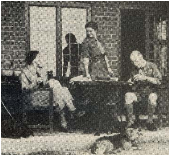
1938 With mum & dad The Guider 1977

Lord & Lady BP were accompanied only by their daughter Heather, who had had a key role in the venture as secretary to the organising committee. She was a very lively and popular participant in all that went on and was no stranger to shipboard life, as she had often accompanied her parents on their world tours and had acted on these occasions as her father's secretary.