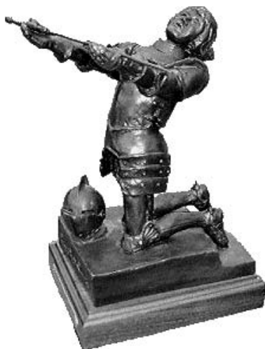
Bronze statue of a Knight based a drawing by B-P